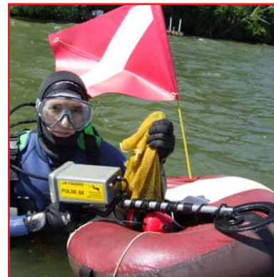
Diver with bag of "treasure"

When the transmitted pulse hits a metal object, an electro-magnetic field is induced in the object. This causes eddy currents to flow in the metal, which in turn generates a second electro-magnetic field. This field is picked up by the coil and then displayed by the meter and heard in the earphones.