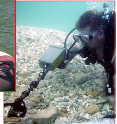
Working a wreck site